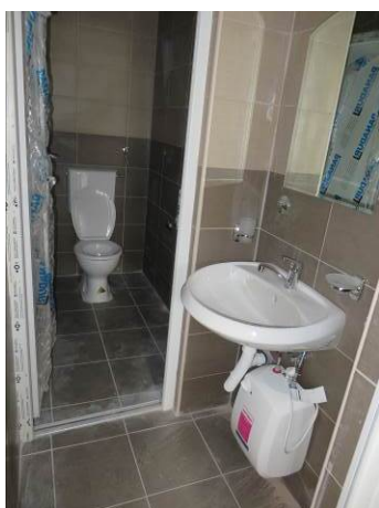
Toilet and small bathroom