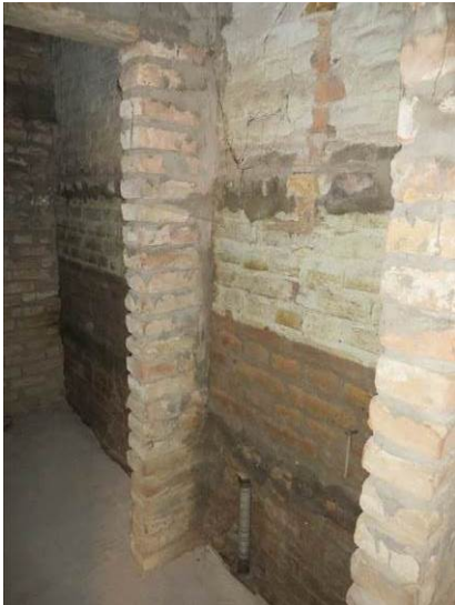
Toilet and small bathroom