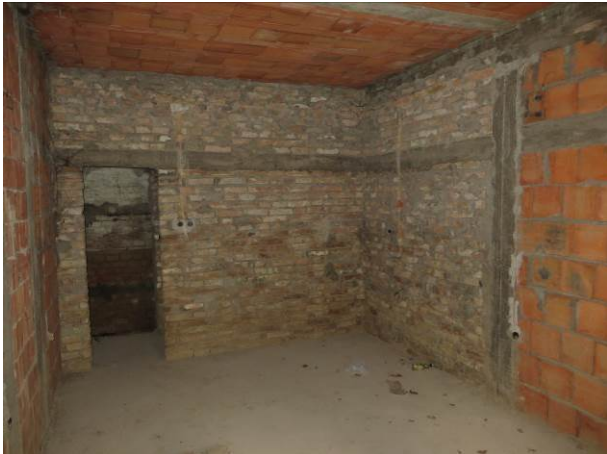
Soup kitchen distribution center