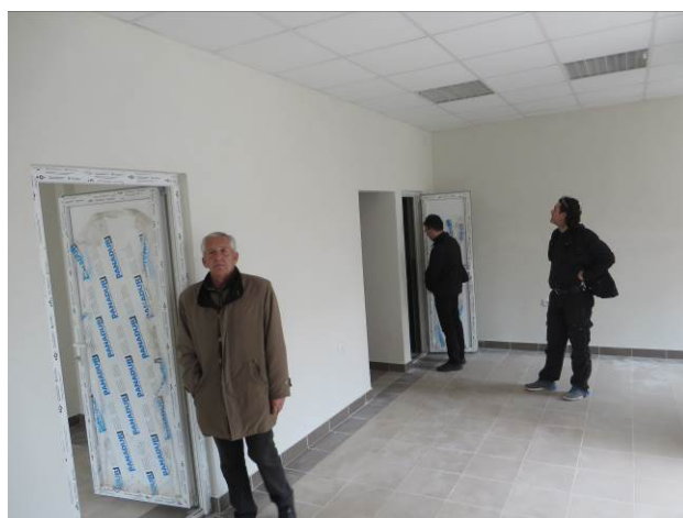
Two offices and toilet / small bathroom - entrance

In addition, to completed repair / reconstruction works, IOCC and Red Cross of Belgrade have agreed that there are still needs for additional works to be carried out, including: