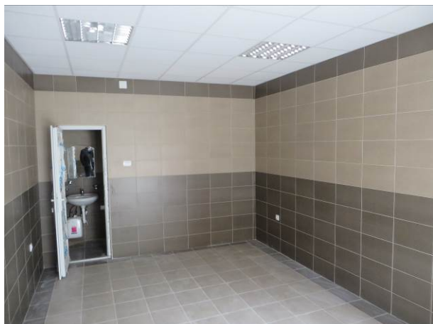
Soup kitchen distribution center