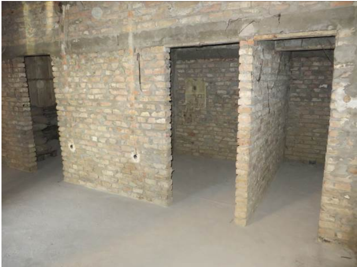
Two offices and toilet / small bathroom - entrance